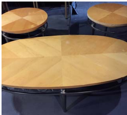
Coffee table with two matching side tables (only one side table is onstage). $50 OBO

Several items on the Come Blow Your Horn set are for sale!