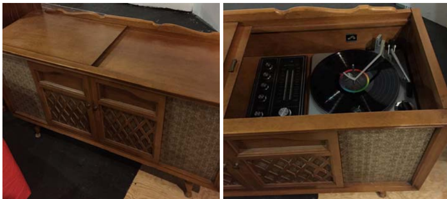
Lovely vintage Hi-Fi stereo unit, in beautiful shape. And it WORKS! $150 OBO

Available the instant the show closes on August 8! Contact the box office or carol@roverdramawerks.com to purchase!